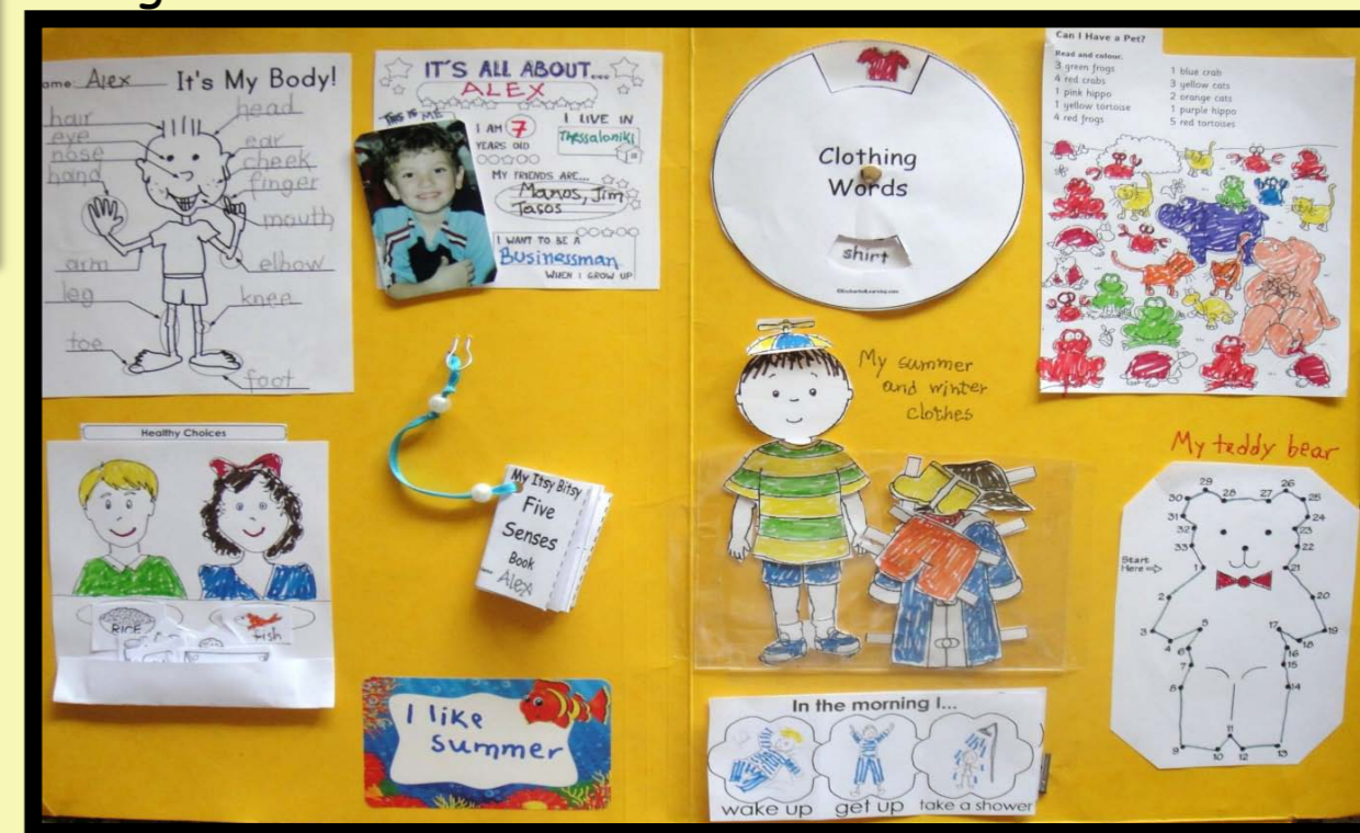
Picture 4 'All about me' Lapbook