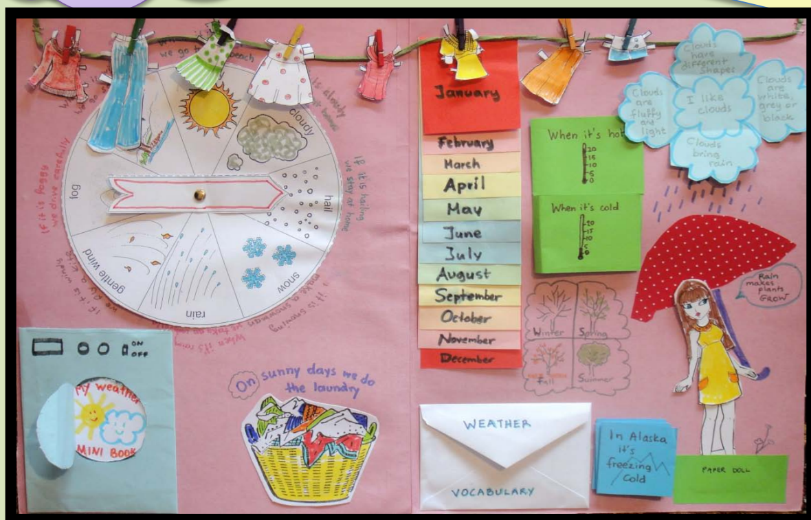
Picture 1 'Weather' Lapbook

"Lapbooks" are collections of mini-books, pictures, graphs and/or "foldables" which are multi-dimensional graphic organizers gathered, designed, drawn, glued, and creatively displayed in an inexpensive file folder that fits in your lap. They can be used at any age (K-12) and level .